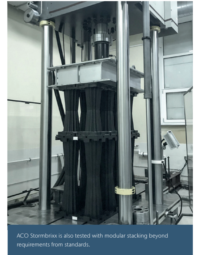
ACO Stormbrixx is also tested with modular stacking beyond requirements from standards.

* may vary for different article numbers